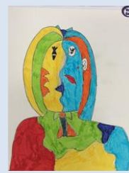
By Evaa A-H