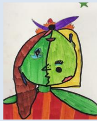
By Lucie P